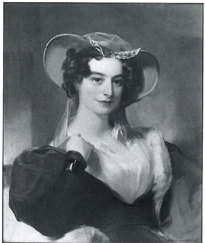
Rebecca Gratz, foundress of the Jewish Orphans Asylum.

Rebecca Gratz, born in 1781, was a prominent Jewish educator and philanthropist. She was also a woman of