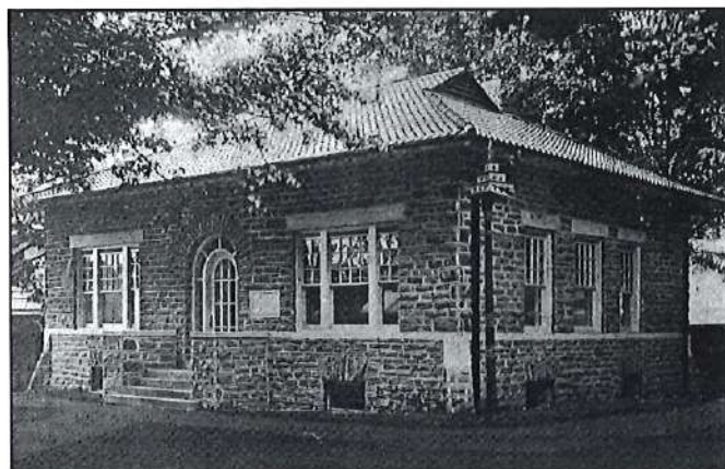
Miriam Wolf Infirmary after completion in 1907.

In the early years until 1896, elementary education was provided in the home by hired teachers. After 1896, the children received their formal education in the public schools within the community, namely Francis D. Pastorius Elementary School, Theodore Roosevelt Junior High School and Germantown High School. If the child showed academic promise, he or she could attend the nearby Central High School for Boys or Philadelphia Girls High School. If a child showed less academic aptitude or an inclination towards a trade, he or she was sent to any of the many trade schools in the Philadelphia area. Only in elementary school did the children travel as a group from the home to the school, overseen by supervisors. While this caused them to