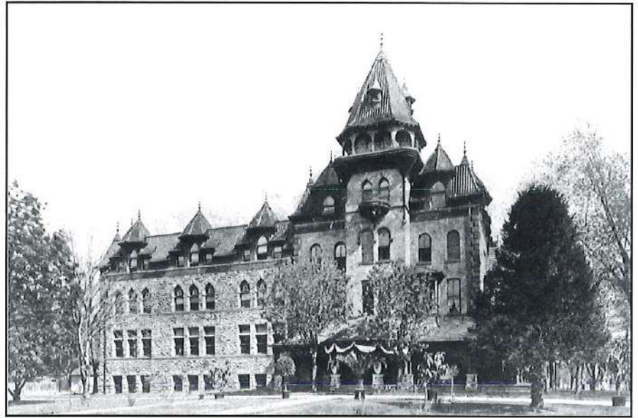
JFHOA at 700 East Church Lane, circa 1905 (before 4-story addition and before the gift of the caribou statue.)

From 1855 to 1874, there was a rapid growth in the Jewish population in Philadelphia, mostly from European countries. That growth led to disunity, disorganization and turmoil among the factions within the Jewish community which, in turn, had an impact on the stream of funds to the Jewish Foster Home. Up until then, the fundraising effort was handled by a collective group of women operating as The Jewish Foster Home Society of Philadelphia. But many individuals felt that a greater impact could be realized by turning the fundraising function over to prominent Jewish men in the business, financial, cultural and religious community. In 1874, this was put in motion with the formation of a Board of Council who undertook a complete reorganization of the institution's governing board. This led in 1875 to the establishment of a new charter, constitution and by-laws to guide the running of the institution. An executive committee was established to oversee the actual operation of the institution while a board of directors was established to oversee its finances and funding. The new charter also brought about a new name for the institution: Jewish Foster Home and Orphans Asylum of Philadelphia. This reorganization proved to be a very successful move and a timely one at that because the continuing influx of Jewish immigrants