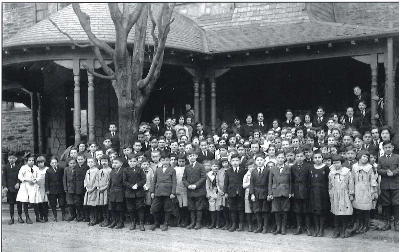
Hebrew orphan wards on porch of 700 East Church Lane, circa 1923.

In 1905, the JFHOA celebrated the 50 th anniversary of its founding. In commemoration of this milestone, a bronze, life-size reindeer was donated anonymously to the home and placed prominently outside the front entrance where it would remain until its removal in the late 1940s.