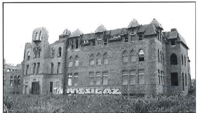
Front of JFHOA mansion in 2007 (after 2000 fire). The portion to the right of burnt-out tower is the 1910 addition to mansion.

There were many interest and social clubs at the home which the children could join, and they were urged to do so. Jewish holidays were always celebrated as well as other secular holidays. Trips to the Colonial or Orpheum Theatres every Saturday to see movies as guests of the theatre managers were highlights of the week. The home had its own Boy Scout and Girl Scout troops which engaged in normal scouting activities, including camping trips. In the summer, visits to Willow Grove Park for a day of rides, amusements and picnicking were popular. There were excursions to see Philadelphia A's baseball games at Shibe Park, courtesy of the ballclub. Each year, the children went to see the Ringling Brothers circus, courtesy of the Gimbel family. Except for the very young, the children were